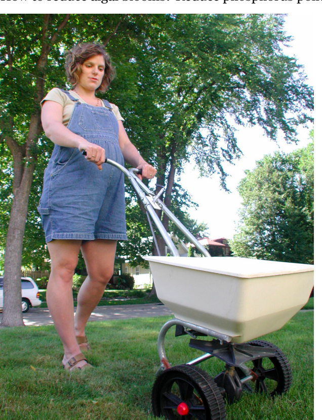
Only use phosphorus fertilizers if your lawn needs it

How to reduce algal blooms? Reduce phosphorus pollution!