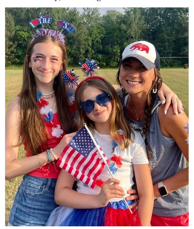
Fun at Ham Lake's Freedom Festival

We are so proud to be a part of this great nation and to be Ham Lakers. This year's Freedom Festival was a wonderful demonstration of neighbors coming together to enjoy great food, fun and friends and to celebrate what it is to be Ham Lake. Thank YOU, our community, for coming out to celebrate!