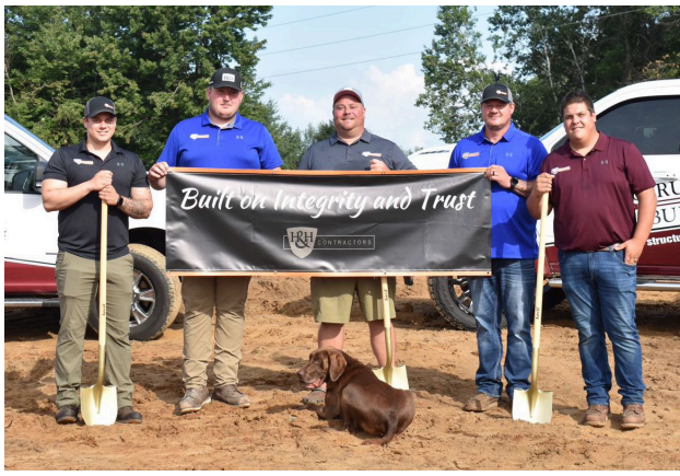
H&H Contractors broke ground for their new building on July 26th. Located just south of Ham Lake City Hall, they expect it to be completed January 2024.