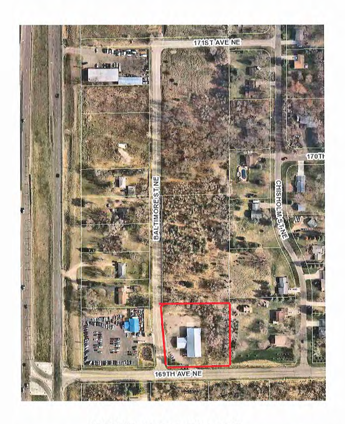
16905 Baltimore Street NE